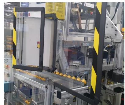
Perspex dividers with edge marking