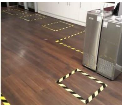
Distancing markers in a kitchen