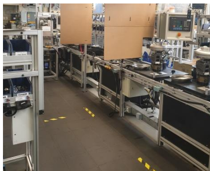
Temporary board dividers