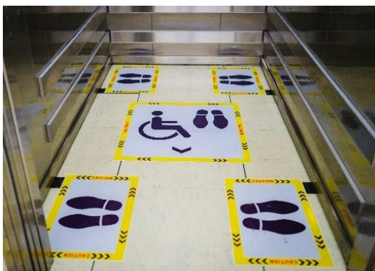
Example lift practices