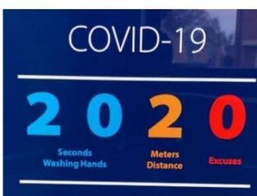
Signage to promote hygiene and social distancing measures